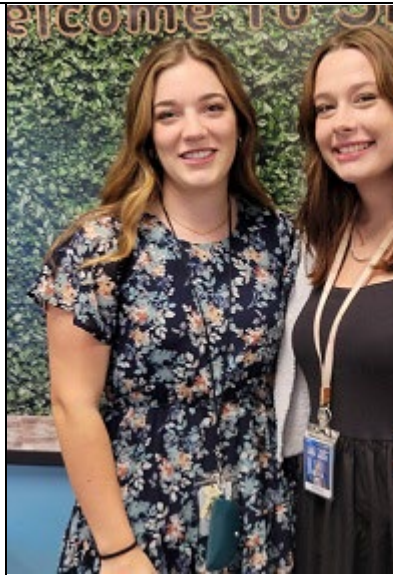
Student Teacher Floating TA