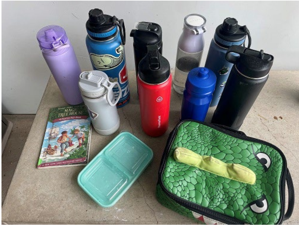
The Lost & Found bin will be cleaned out and items donated on Thursday, October 6th